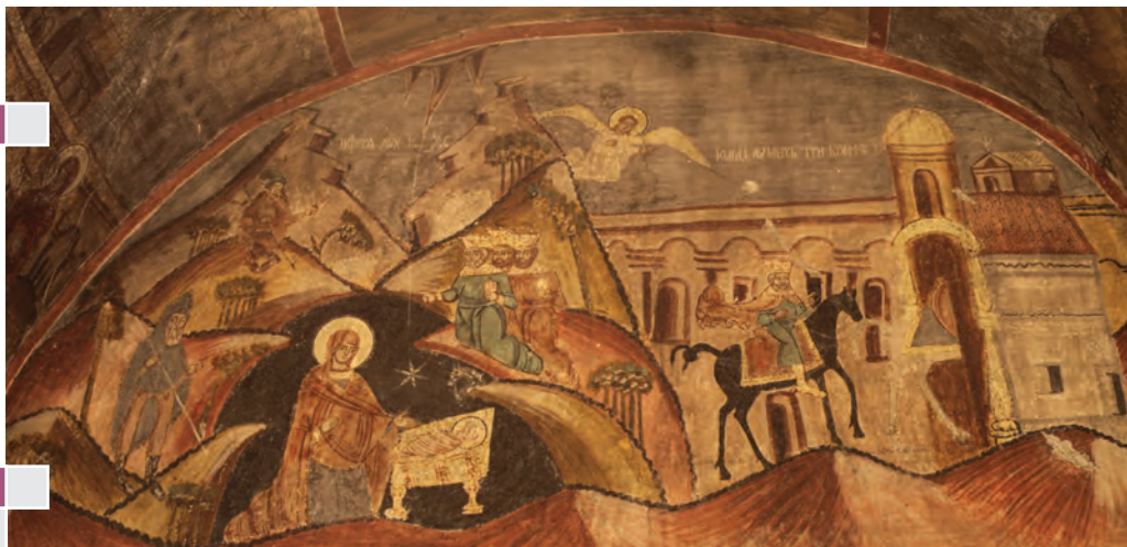
Image from the "Saint Nicolas" Church (Brădiceni, Gorj County, Romania), presented in the exhibition Highlights of Orthodox spirituality. Churches with exterior mural painting in Oltenia (18 th -19 th centuries) , Terni, Italy, December 2010.