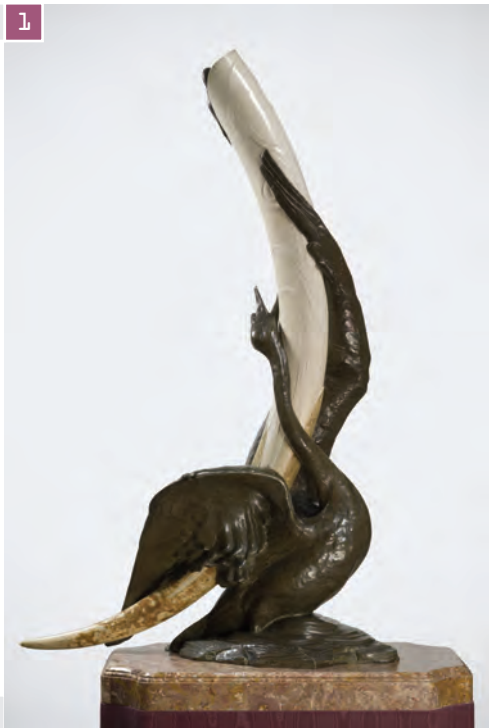
La Caresse du Cygne , 1897 Philippe Wolfers (1858 - 1929) Ivory, Bronze, Marble ; 173 x 129 x 76

When looking at the object, one sees a swan and a dragon fighting each other, using the ivory tooth - the document holder decorated with flowers and plants as a shield. The swan spreads its wings upwards to heaven and bra-